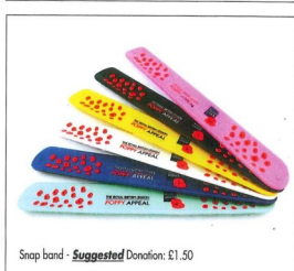
Snap band - Suggested Donation: £1.50