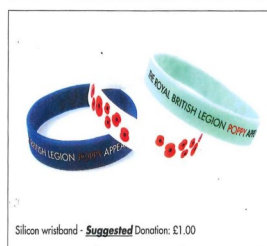
Silicon wristband - Suggested Donation: £1.00