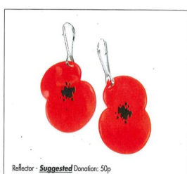
Reflector - Suggested Donation: 50p