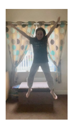
Year 6 have been enjoying Well Being Wednesday den building, reading and exercising.